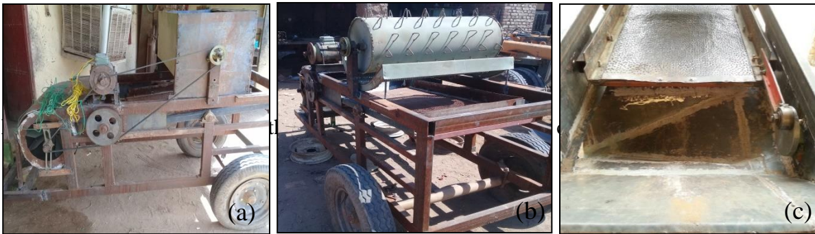
Fig. 2: (a) prototype of wheat thresher, (b) threshing drum and concave, (c) clean grain pan

1- screw jack, 2- high capacity fan, 3- electric motor, 4- frame, 5- threshing cylinder, 6- trashes pan, 7- threshing drum, 8- shaker, 9- bearing, 10- sieve, 11- driving wheel, 12- drum pulley, 13- bearing housing, 14- shaker pulley, 15- clean grain pan, 16- fan pulley, 17- crank